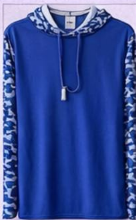
Royal Blue / Blue Camo