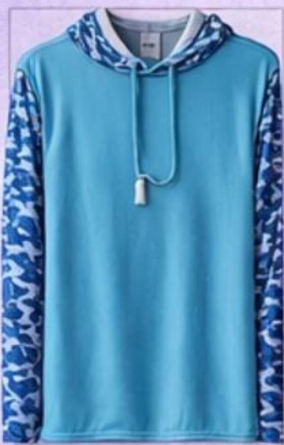
Teal / Blue Camo