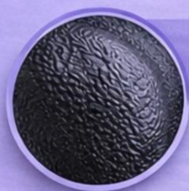
Textured Nitrile Coating

Durable, high-visibility work gloves designed to provide superior grip, comfort, and protection on the job. Ideal for construction, maintenance, landscaping, and general work applications.