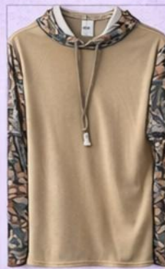
Tan / Woodland Camo