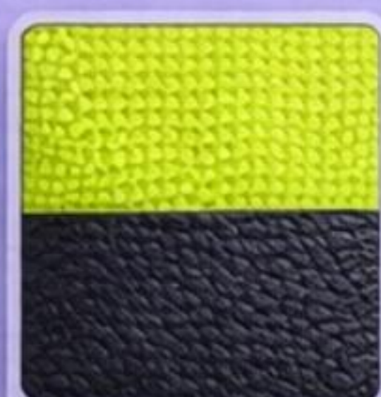
Hi-Vis Lime & Black