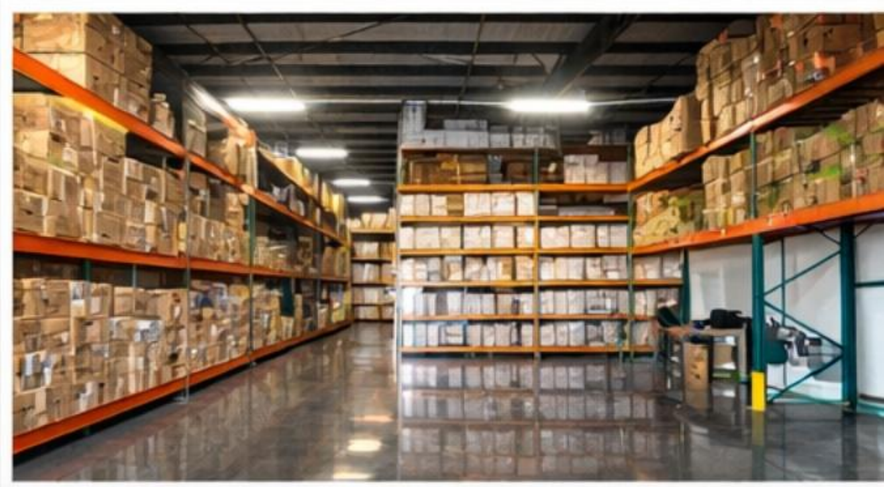
A look inside our Tampa, Florida facility.

From high-visibility safety garments to premium blank essentials , every piece is made to perform and hold its value over time.