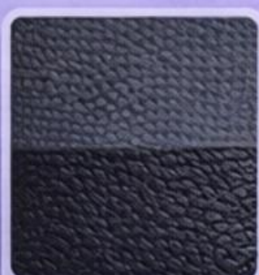
Dark Grey & Black