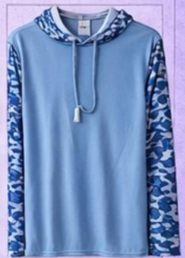
Light Blue / Blue Camo