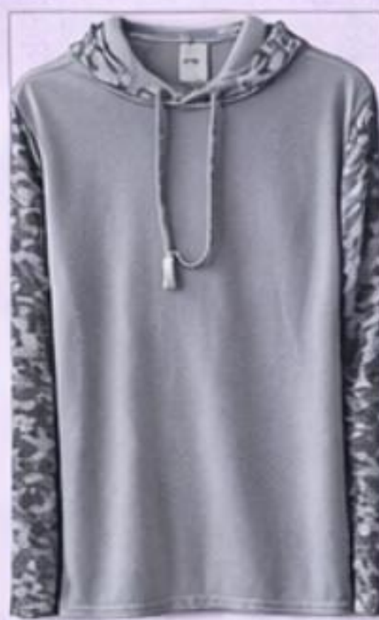
Grey / Grey Camo