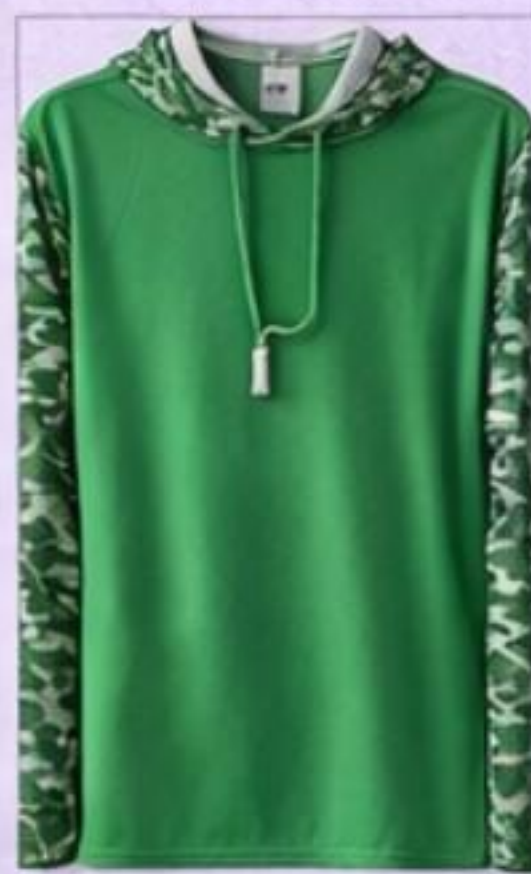
Green / Green Camo